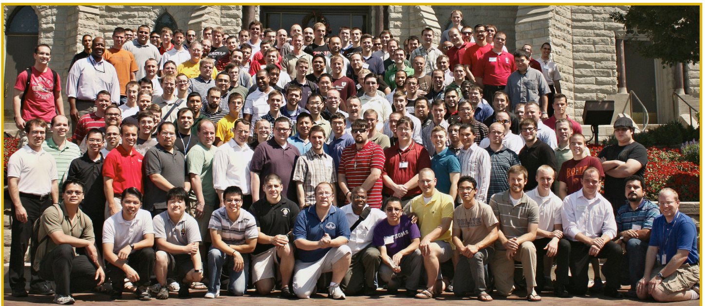
2012 Participants in the Spiritual Formation for Diocesan Seminarians Program

We look forward to continuing to welcome the long, proud line of Washington seminarians who make the annual trek to Creighton as well as all others, from near and far!