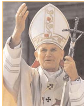
Pope John Paul II's writing became the foundation of IPF's mission.