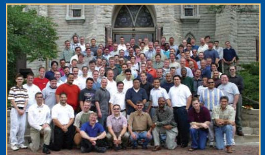
A new group of 122 men are awaiting the summer program to begin May 30.

The summer Seminar for Seminary Spiritual Directors will find 14 priests from various seminaries gathering together for three weeks of growing in the art of spiritual direction. The seminar helps root spiritual direction in the context of seminary formation.