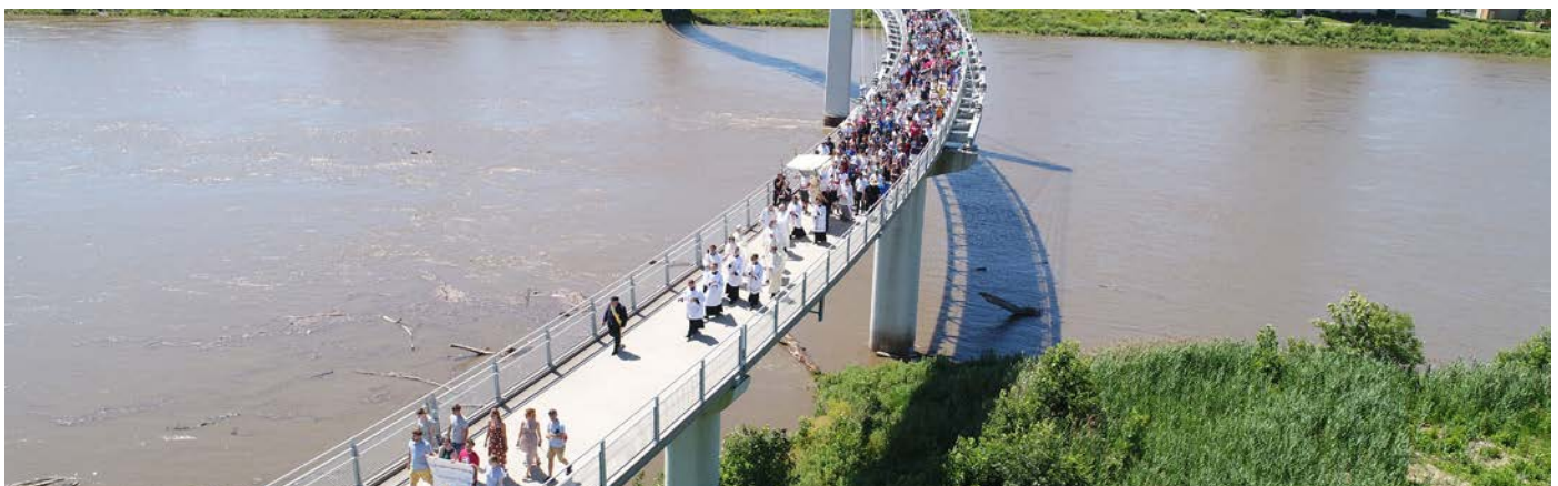
Pilgrims walk across the Missouri River from Nebraska to Iowa to continue the route of the National Eucharistic Pilgrimage.

For those unable to participate in the larger event in Indianapolis, it was a unique opportunity to share in this initiative designed to increase reverence and love for the Blessed Sacrament.