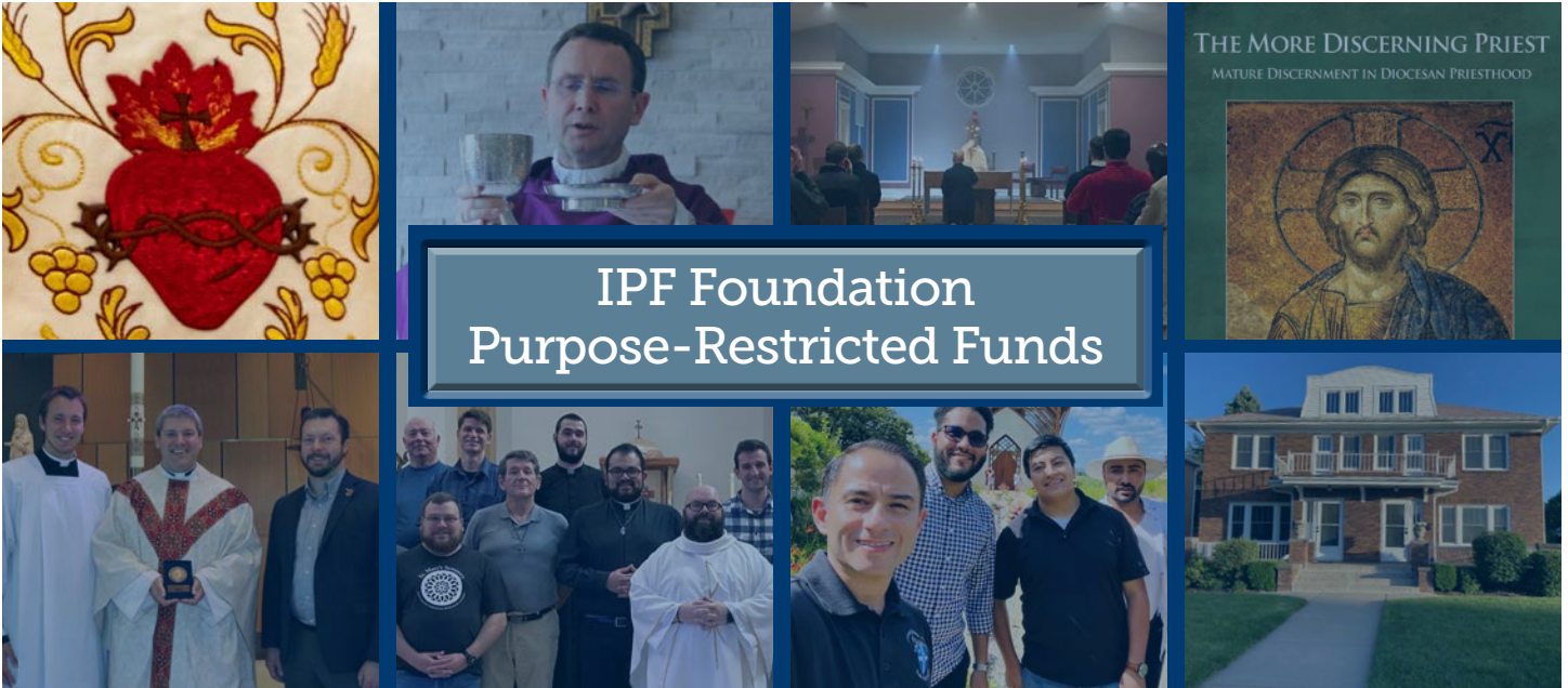
IPF Foundation Funds from the top left to the bottom right: 1) Sacred Heart Legacy Society; 2) St. Charles Borromeo Spiritual Program for Bishops Fund; 3) St. Ignatius of Loyola Spiritual Direction Training Fund; 4) St. Paul Communications and Publication Fund; 5) St. John Paul II Fund for Priests; 6) Blessed Stanley Rother Pre-Ordination Retreat Fund; 7) St. Joseph and Mary Seminarian Fund; 8) Nazareth House Fund

The sixth article in the series on the IPF Foundation Purpose-Restricted Funds that provides more detailed information on each fund and explains why a thriving Foundation is essential.