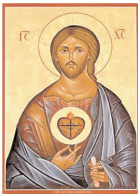
United to the Heart of Christ.