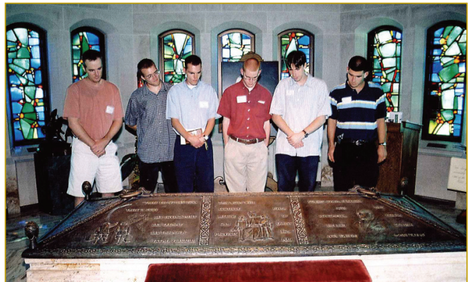
Seminarians tour the Dowd Memorial Chapel at Girls and Boys Town.

The seminarians concluded the evening by introducing themselves and identifying their respective arch/dioceses.