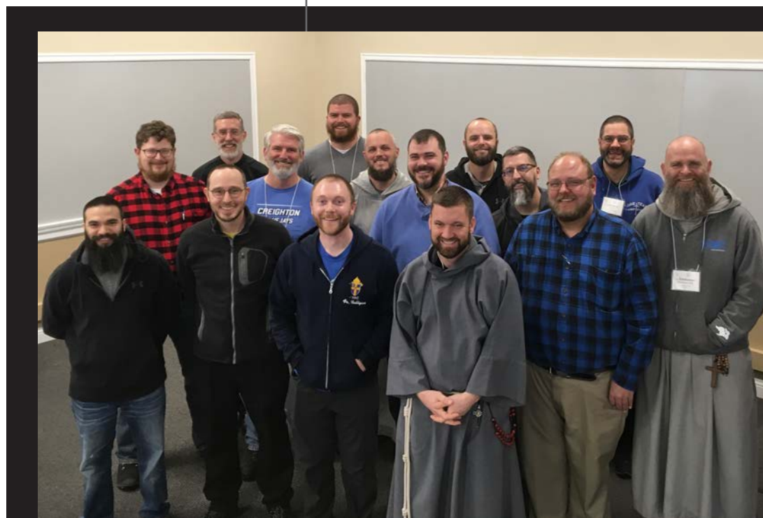
Pictured: A small group of participants in Section B of the Spiritual Direction Training Program smile for the camera. There are two sections of this program, with 126 participants in total.