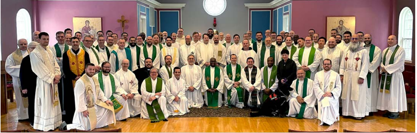
Participants and IPF staff for Section A of the 2021-2024 Spiritual Direction Training Program held at Mundelein Seminary/ University of St. Mary of the Lake in Mundelein, Illinois pose for a group photo during their final session in January 2024.

The IPF staff will soon welcome approximately one hundred and fifty priests into a new cohort of its Spiritual Direction Training Program held at the University of St. Mary of the Lake/ Mundelein Seminary Conference Center in Illinois. The two sections of priests will begin in Spring 2024 and conclude in Winter 2027, meeting one week each spring, fall, and winter for the next three years.