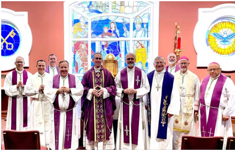
Group photo of the 2021-2024 IPF Spiritual Formation Program for Bishops.

This February, we concluded our inaugural three-year spiritual program for bishops. Our initial cohort of ten bishops met for two weeks each year, for the past three years. All of us are left with deep gratitude that this program has impacted our ten bishops and also affects all the faithful members of each bishop's diocese. Our desire, three years ago, was to bring IPF's long history of providing spiritual direction, silent retreats, and education in the spiritual life to the life and ministry of bishops in a more intentional way. This inaugural program for bishops focused on the spiritual life as the heart of the bishop's ministry to help him shepherd from the depth of his communion with God.