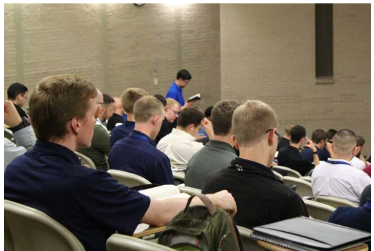
Seminarians listen and reflect on the scriptures as part of evening prayer each night during the summer program.