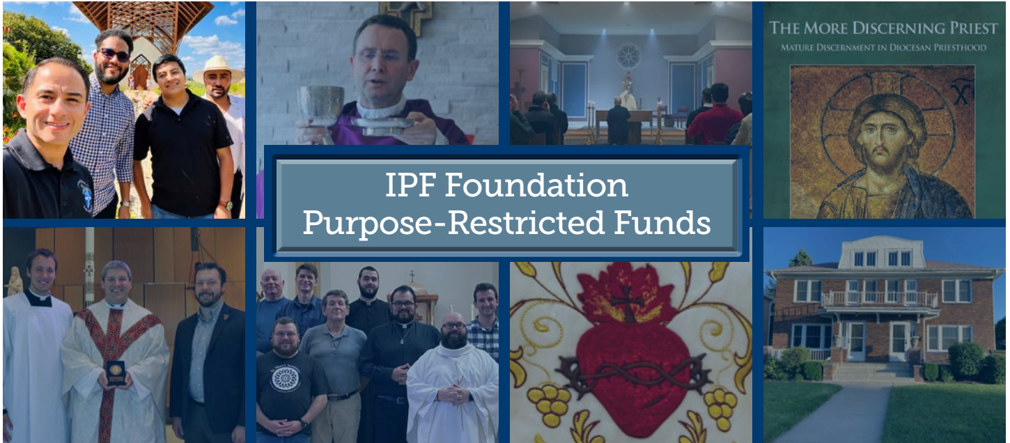
IPF Foundation Funds from the top left to the bottom right: 1) St. Joseph and Mary Seminarian Fund; 2) St. Charles Borromeo Spiritual Program for Bishops Fund; 3) St. Ignatius of Loyola Spiritual Direction Training Fund; 4) St. Paul Communications and Publication Fund; 5) St. John Paul II Fund for Priests; 6) Blessed Stanley Rother Pre-Ordination Retreat Fund; 7) Sacred Heart Legacy Society; 8) Nazareth House Fund

The fifth article in the series on the IPF Foundation Purpose-Restricted Funds that provides more detailed information on each fund and explains why a thriving Foundation is essential.