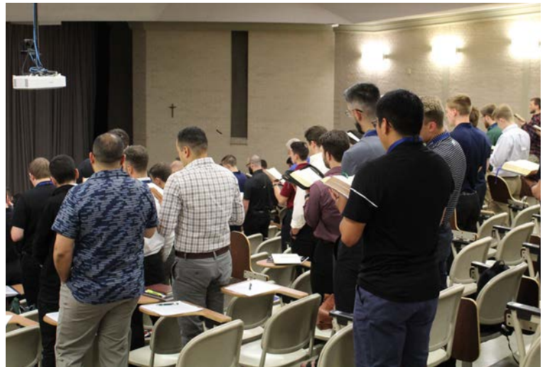
Evening prayer during the first week on campus is offered before beginning daily large group conference talks.